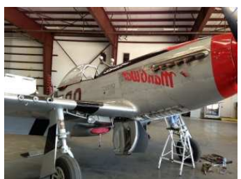
P-51 Mustang Man-O War