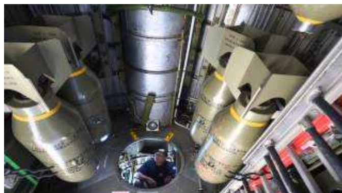
WWII B-29 Superfortress "Fifi" lands in Modesto as part of the Commemorative Air Force Central Valley Squadron AirPower History tour. Retired Air Force pilot Mark Novak who pilots the plane talks about it.

Modesto's Central California Valley Squadron invited the Texas-based World War II-era bomber crew to stop in Modesto during a trip that included visits to Arizona, Southern