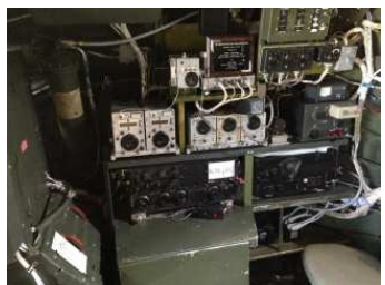
"FIFI" KM4RC station was on air from FW to Prescott, AZ