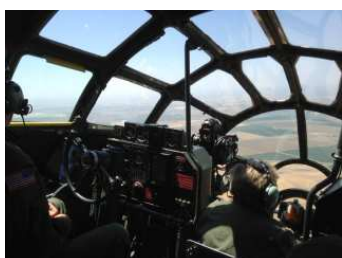
Cindy in FIFI Bombardier position