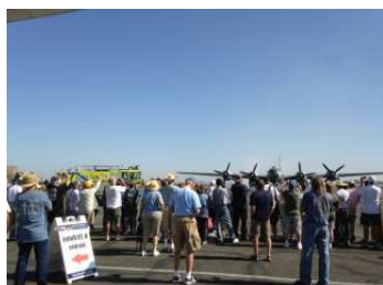
Large crowds wait to peek inside "FIFI" Bombay and cockpit.