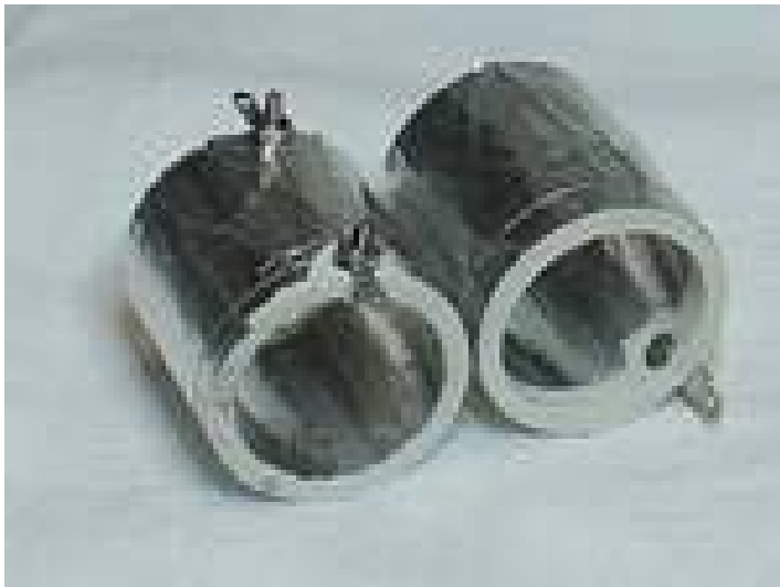
Photo A: Homebrew capacitors showing the inside/outside screw contacts.

I cut a 4.2" length of aluminum tape that I attached to the inside of the PVC pipe, and I cut a 5.5" piece of aluminum tape that was wrapped around the outside of the PVC pipe. When I measured the resulting capacitance with my antenna analyzer, I found it to be 35pf. This was perfect! So next I attached two #4 stainless steel screws, lockwashers, nuts and solder lugs to my homebrew capacitor. I cut away the aluminum tape such that one screw only contacted the upper piece of tape, and one screw contacted the lower piece of tape. Photo A shows this better than I can describe it. I built two of these capacitors, as two are needed for the 12/17 meter dipole.