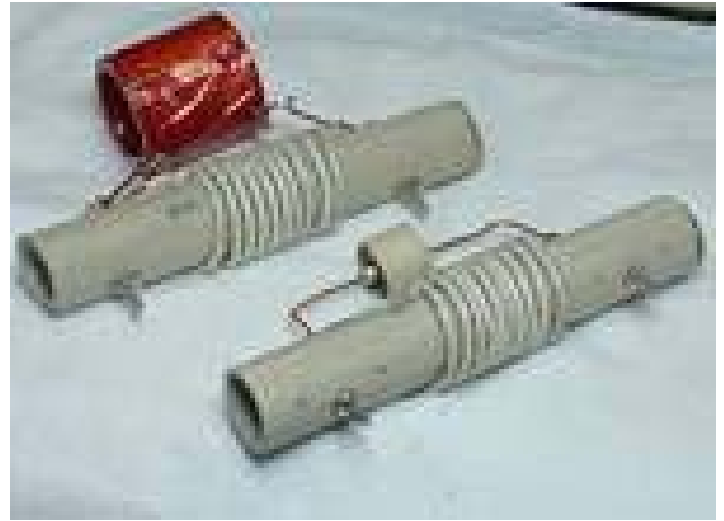
Photo B: 12-Meter traps, one with the homebrew capacitor and one with a doorknob capacitor.

tor. The red coating on the homebrew capacitor is the red liquid electrical tape I used.