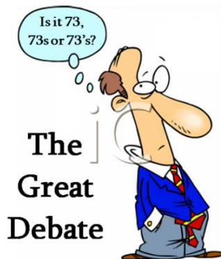
For a great discussion, take a look at https://www.amateurradio.com/best-regardses-and-73/

The U. S. Post Office offers a very useful "free" service called "Informed Delivery". The service provides eligible residential consumers with a digital preview of their household's incoming mail scheduled to arrive soon (for letter-sized mail pieces that are processed through USPS automated equipment). Users can view greyscale images of the exterior, address side of incoming mail (not the inside contents) via email or an online dashboard. This is a handy tool to help insure you're getting expected mail such as checks or bills. The service also provides advance notification of Priority Mail packages coming to your home. Check it out at https://informedelivery.usps.com .