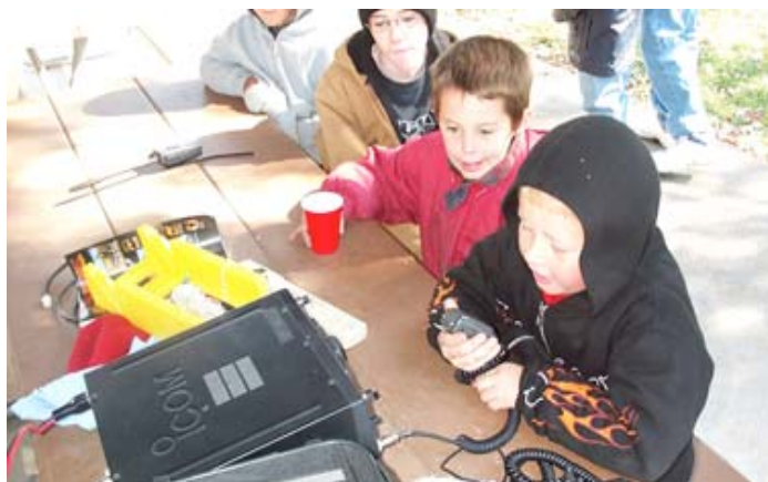
And here are the results of a Radio Club with members who will run for a club office. (From Pella ARC, Pella, IA)