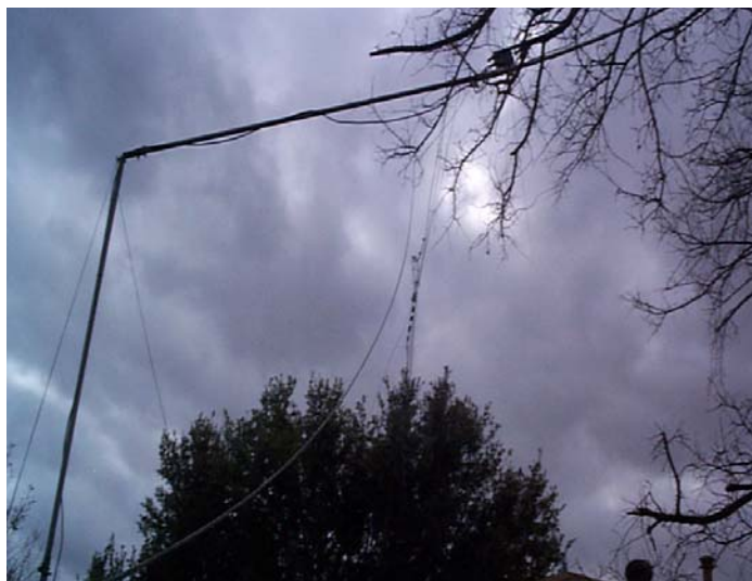
Here are the reported results when one radio club had few members offer to serve as officers.