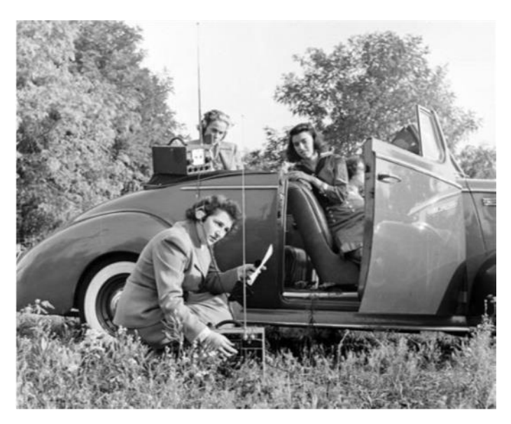
Ham Radio Circa 1940