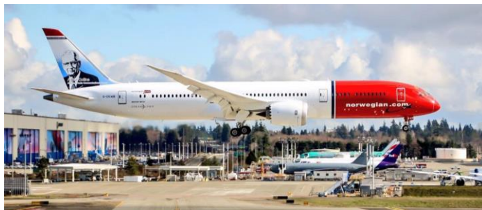
Norwegian 787-9 landing at KPAA after a test flight.