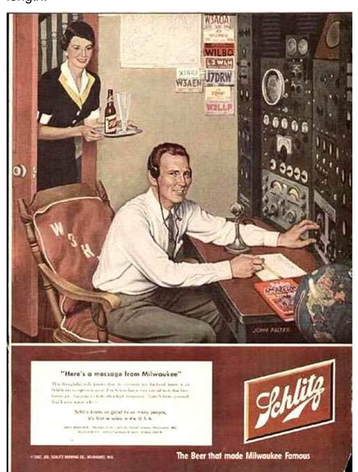
The Way Things Should Be

One engineer shook his head and laughed, "A lot of good that does us. We ask for the height and she gives us the length!"