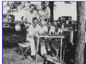
1933 Field Day at W9OAR

For the second Field Day of 1934, the multiplier for sections and countries was removed, emphasizing the total number of stations contacted.