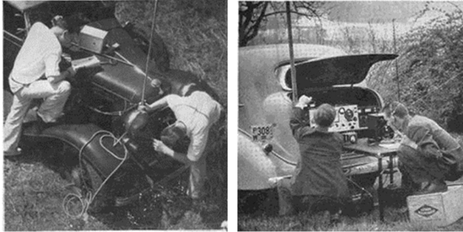
Quick Set-Up, Eh!

In 1937 the "Field Day message" was born. This bonus gave 10 points (before multiplier) and was awarded for a single properly formed and serviced message to ARRL HQ stating the number of ops, location, "conditions", and power. For the first time, the winning QSO total reached 204, with a breathtaking average rate of 7.5 QSOs per hour.