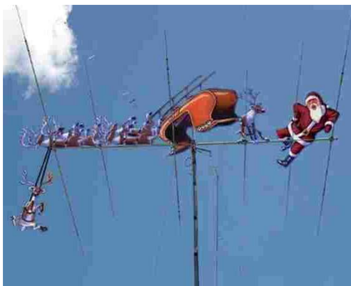
If Santa failed to make it to your house this year, this could be the reason why. Danged Hams! There ought to be a law!