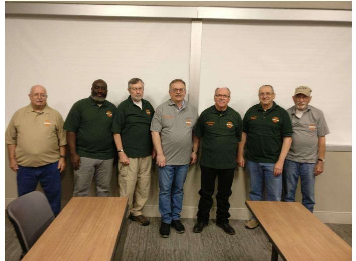
Showing off new club shirts at the November meeting

https://www.youtube-nocookie.com/embed/cFb0nLCKypg?rel=0