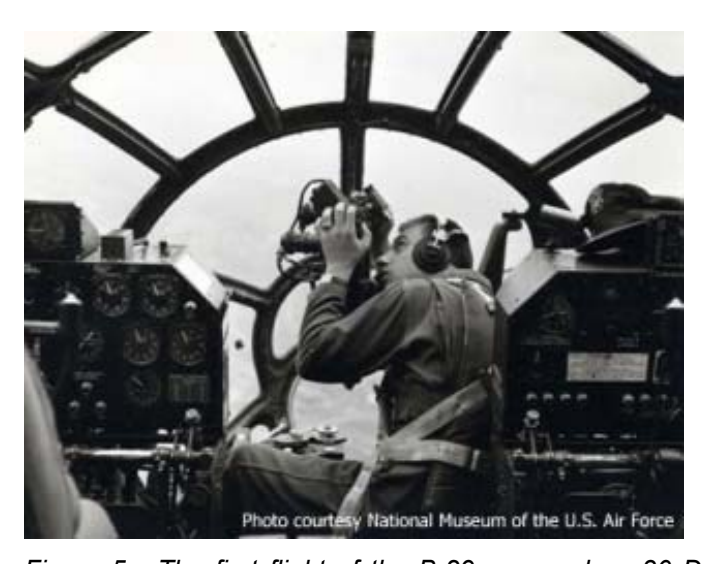
Figure 5 - The first flight of the B-29 occurred on 30 December 1942. Extensive changes and modifications were made during the development of the aircraft before it entered service in April of 1944.