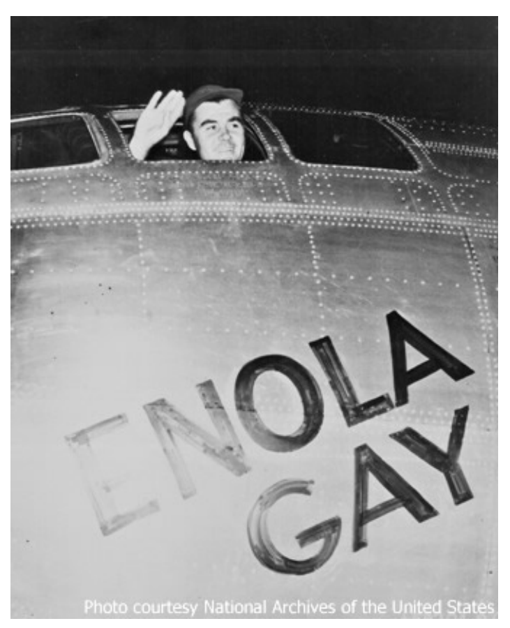
Figure 4 - The B-29 is most well-known for two missions that occurred in August 1945, the missions flown over Hiroshima and Nagasaki that lead to the end of World War II.