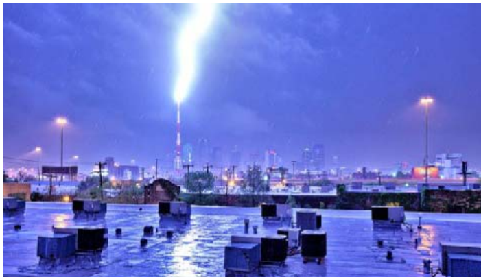
Photo of the Fair Park tower in Dallas taking a direct lightning hit.